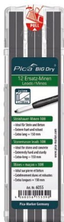
6055 Stonemason leads 10H Ideal for stone and concrete. Extremely hard and sturdy.