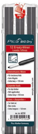
6050 Carpenter leads For dry timber.