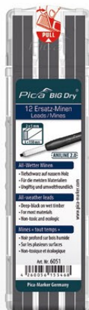
6051 ANILINE 2.0 "All-weather leads" Deep-black application on wet timber.