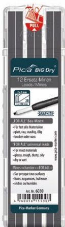
6030 FOR ALL universal graphite leads For almost all materials.