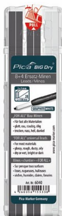
6040 FOR ALL universal leads Graphite + White 8 Graphite leads + 4 white leads. For almost all materials.